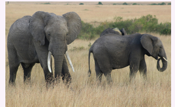
Spotting the big 5